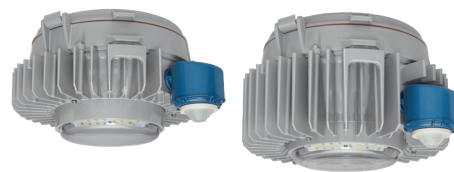
MGC + Frosted Globe + Pendant Mount