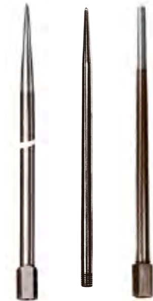
Ⓐ Ⓑ Ⓒ 5/8" COPPER POINTS (CLASS I OR II)

THE 3/8" COPPER AND 1/2" ALUMINUM AIR TERMINALS SHOWN HERE ARE FOR CLASS I USE. 1/2" COPPER AND 5/8" ALUMINUM POINTS ARE FOR CLASS I OR II USE.