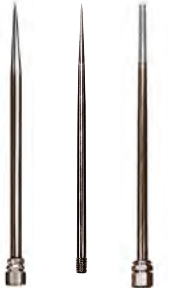
Ⓐ Ⓑ Ⓒ 1/2" COPPER POINTS (CLASS I OR II)