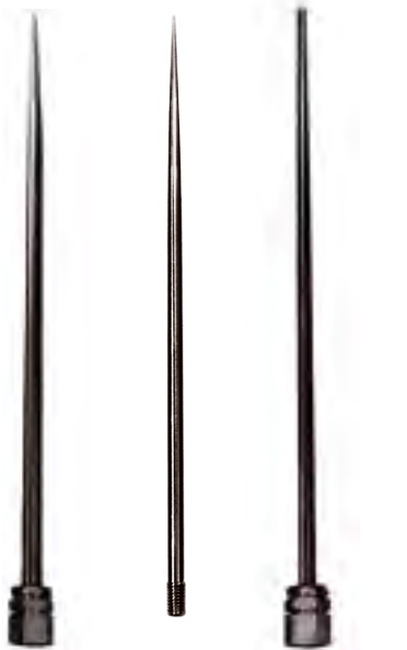
Ⓐ Ⓑ Ⓒ 3/8" COPPER POINTS (CLASS I ONLY)

Ⓐ “ADAPTER TYPE” Ⓑ LESS ADAPTER “LA” TYPE