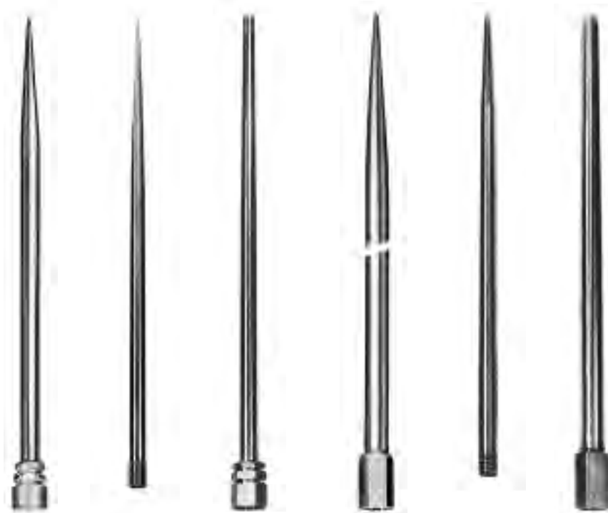
(A) (B) (C) 1/2" ALUMINUM POINTS (CLASS I ONLY)